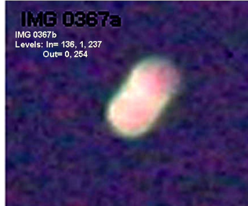
Figure 16 Image 0367 - Contrast/Brightness Change