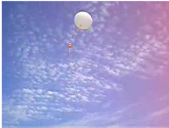
Figure 17 NOAA Weather Balloon Soon after Launch

upon rising to 2,000 feet the average balloon would have a diameter of about 6.2 feet. 16 Using the Combined Gas Law Equation 17 one can calculate the expansion dimensions of balloons under different conditions. Table 2 presents calculated balloon diameters and plane angles for the altitudes shown and (only for convenience) assuming constant temperature and pressure and a six foot diameter balloon: