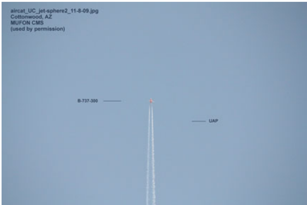
Figure 3 Photograph 2 of Commercial Airplane and UAP Behind Airplane on its Left Side (IMG 0296) T = 17:16:39 1/400 th sec. f8 250 mm

The remaining five photos of the UAP and jet contrail in Series I are not included here; the lateral distance (mm) between the UAP and the center of the contrail were: 8 (frame 3: +11(right of centerline); frame 4: +5.8; frame 5: -1.5 (left of centerline); frame 6: -8; frame 7: -13; T = 17:16:40). The total elapsed time for these seven images was thirteen seconds or 1.9 seconds per image. These measured UAP offset distances are used later.