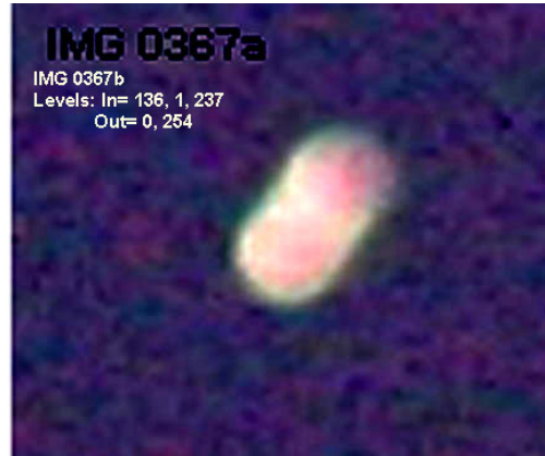
Figure 16 Image 0367 - Contrast/Brightness Change