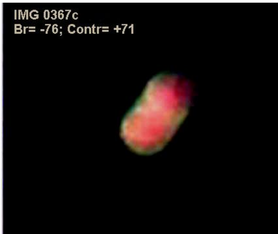
Image 0367 - Contrast/Brightness Change