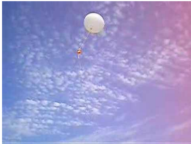
Figure 17 NOAA Weather Balloon Soon after Launch

upon rising to 2,000 feet the average balloon would have a diameter of about 6.2 feet. 16 Using the Combined Gas Law Equation 17 one can calculate the expansion dimensions of balloons under different conditions. Table 2 presents calculated balloon diameters and plane angles for the altitudes shown and (only for convenience) assuming constant temperature and pressure and a six foot diameter balloon: