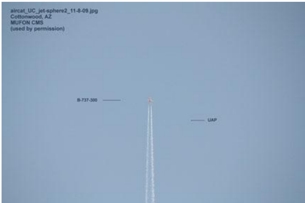
Figure 3 Photograph 2 of Commercial Airplane and UAP Behind Airplane on its Left Side (IMG 0296) T = 17:16:39 1/400 th sec. f8 250 mm

The remaining five photos of the UAP and jet contrail in Series I are not included here; the lateral distance (mm) between the UAP and the center of the contrail were: 8 (frame 3: +11(right of centerline); frame 4: +5.8; frame 5: -1.5 (left of centerline); frame 6: -8; frame 7: -13; T = 17:16:40). The total elapsed time for these seven images was thirteen seconds or 1.9 seconds per image. These measured UAP offset distances are used later.